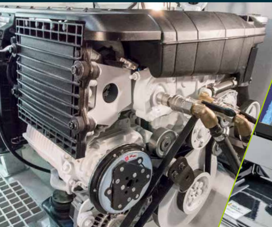
powerful double engine