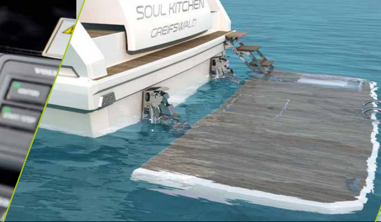
hydraulic bathing platform