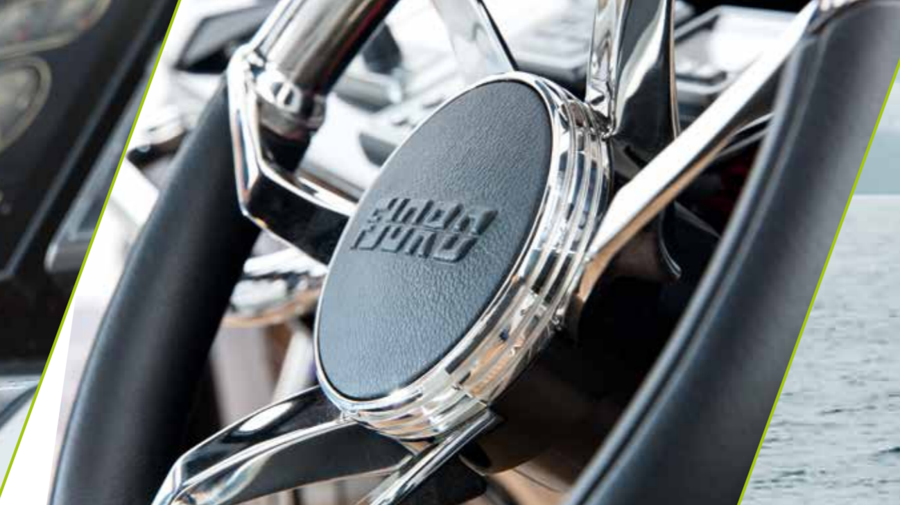
exhilarating driving experience