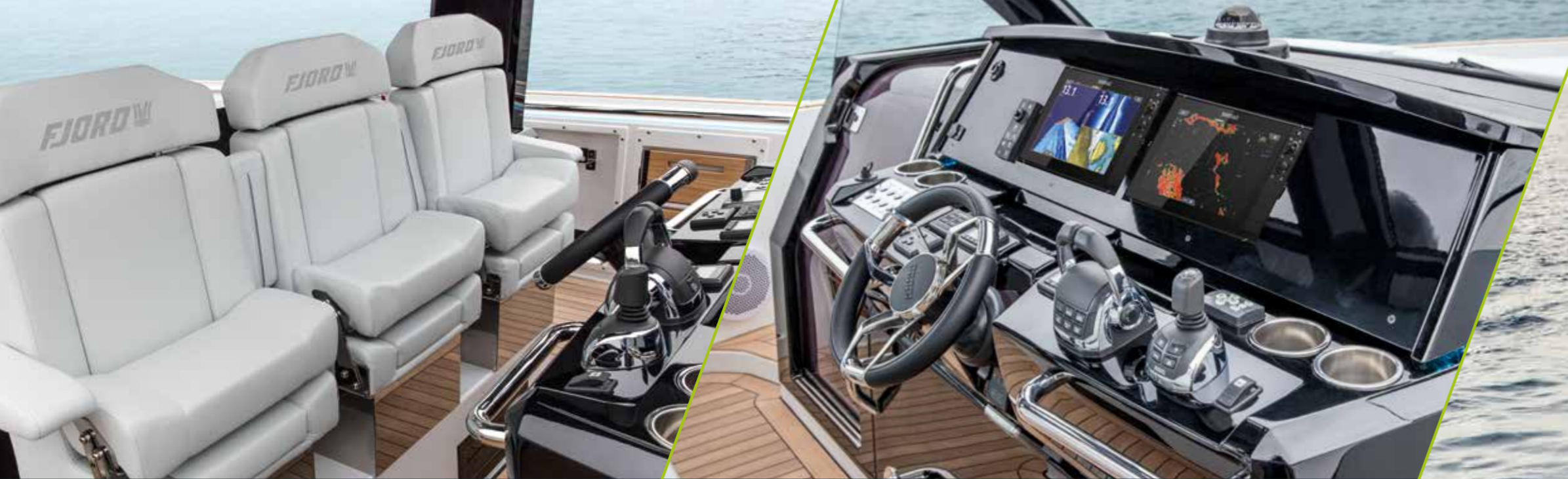
smart seat design for standing and sitting position | stylish and clearly arranged dashboard