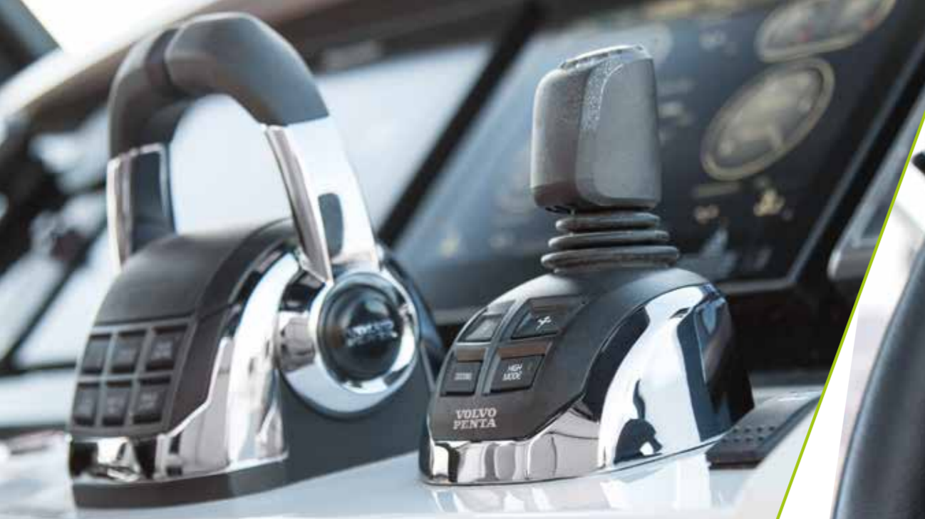
relaxed joystick-manoeuving from the helm