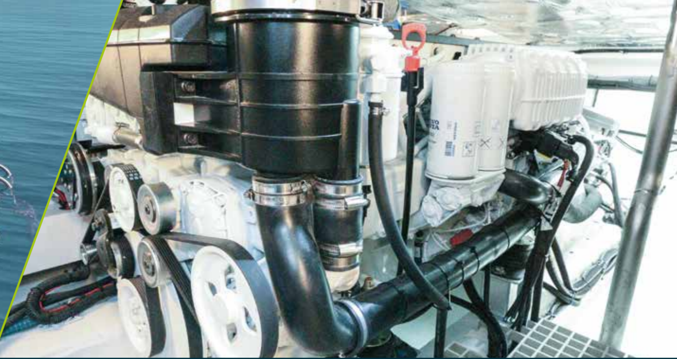
IPS600 double engine