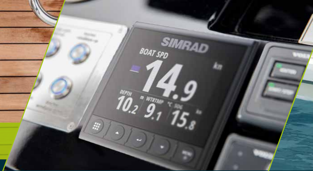
Simrad IS42 multipurpose instrument

Due to the impressive range of special gadgets, smart devices, useful details and engine options, individualising your FJORD 44 open can be as enjoyable as driving her. Take a look at your countless configuration possibilities.