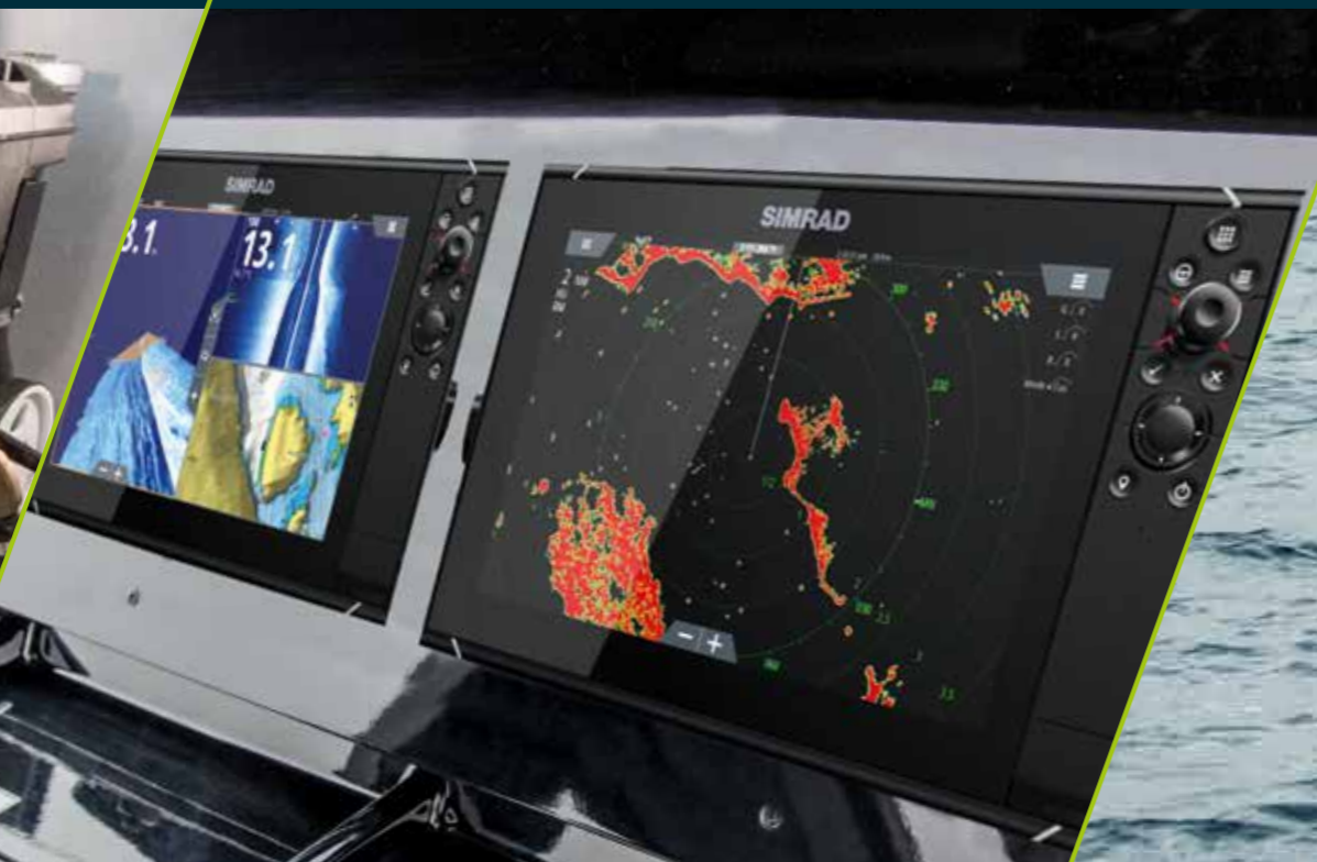
double chart plotters