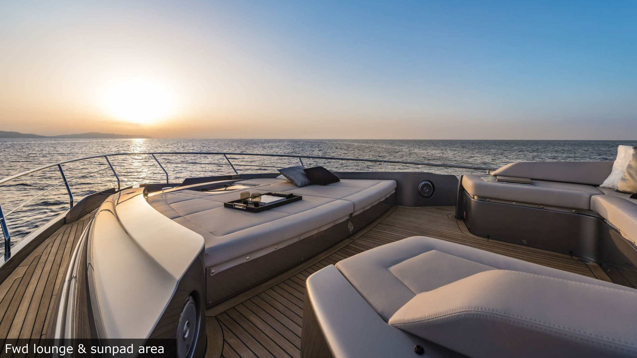
Fwd lounge & sunpad area