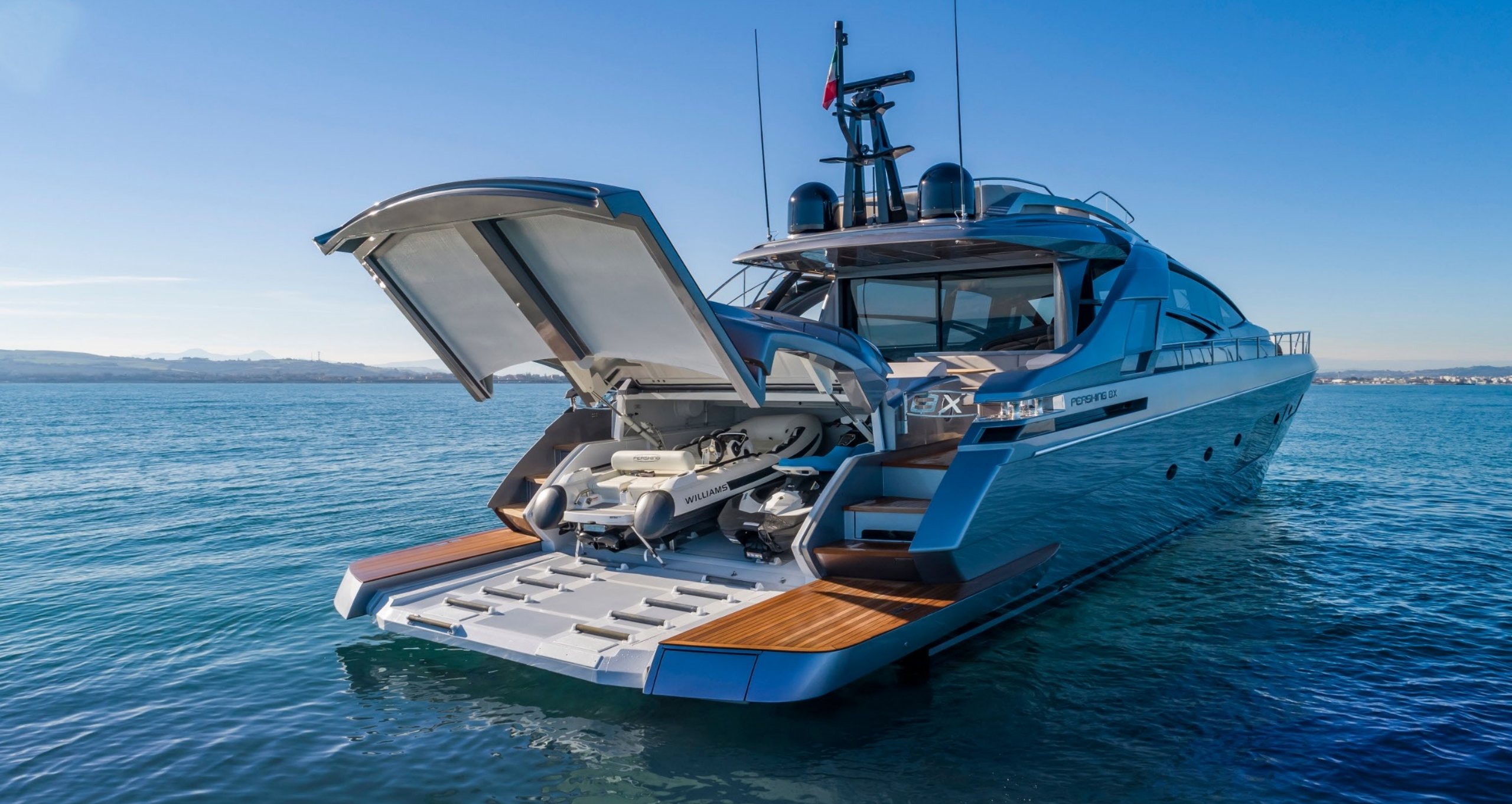
The huge swimming platform revealing the amazing garage & sunpad area