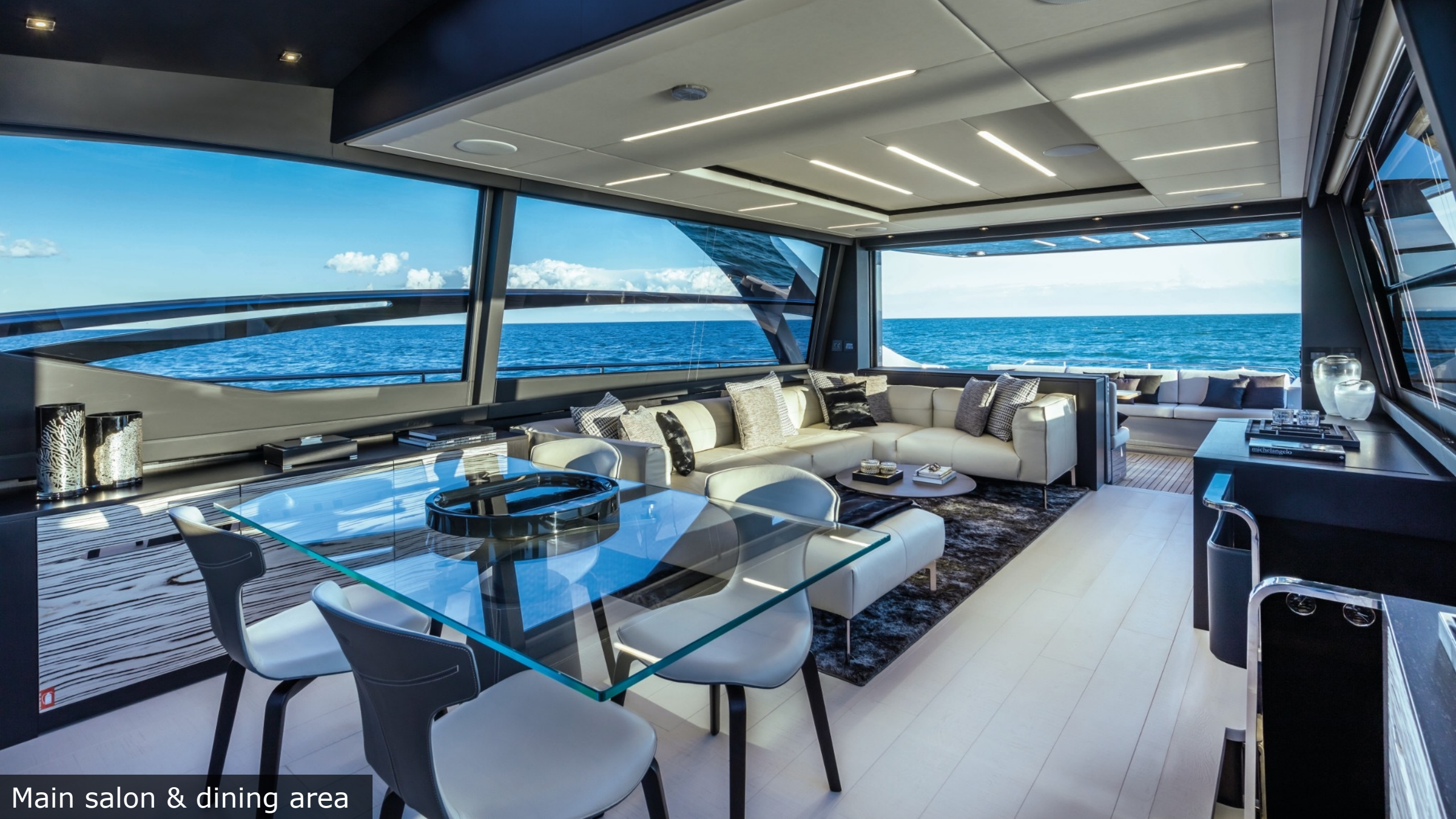
Main salon & dining area