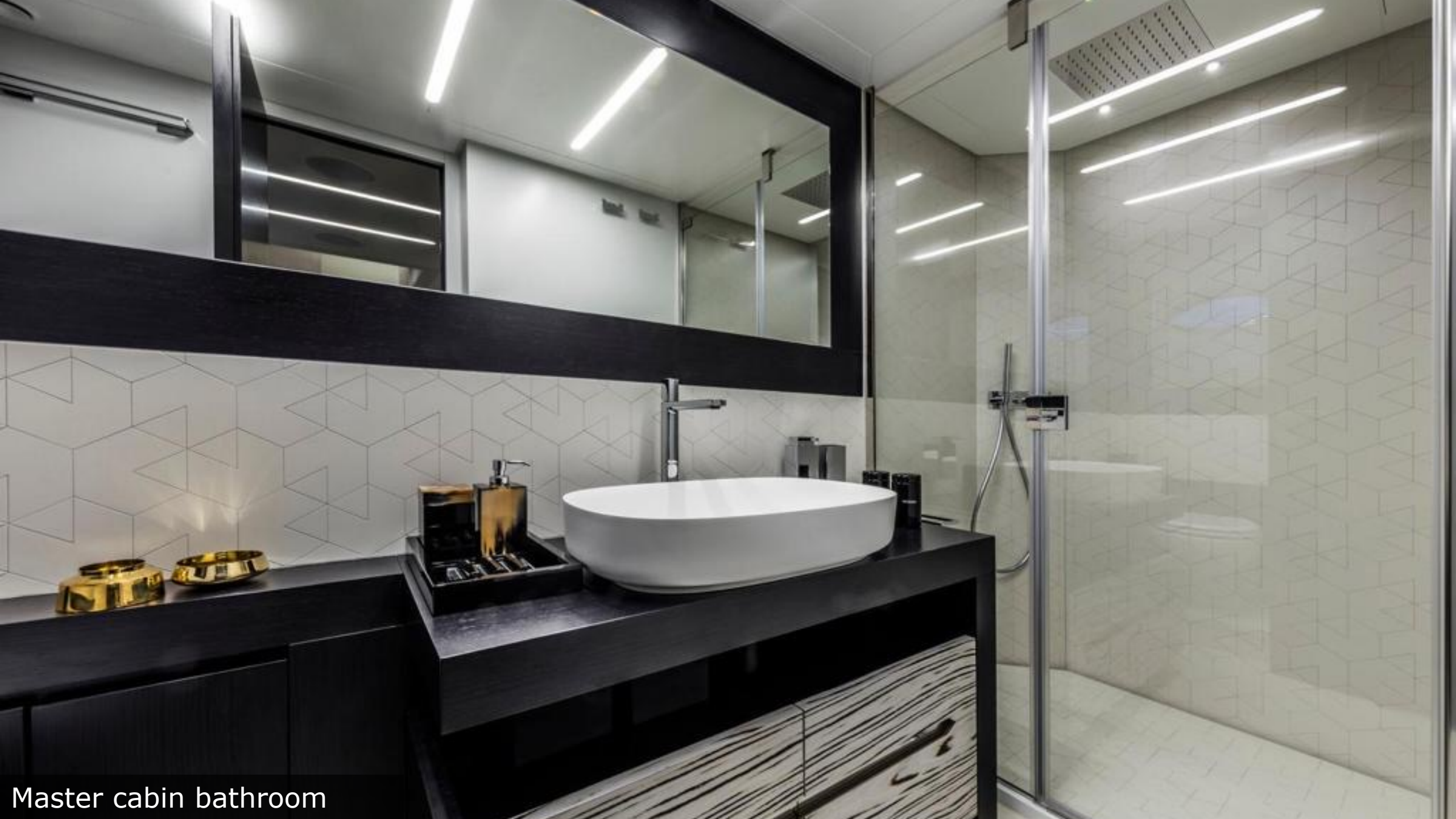
Master cabin bathroom