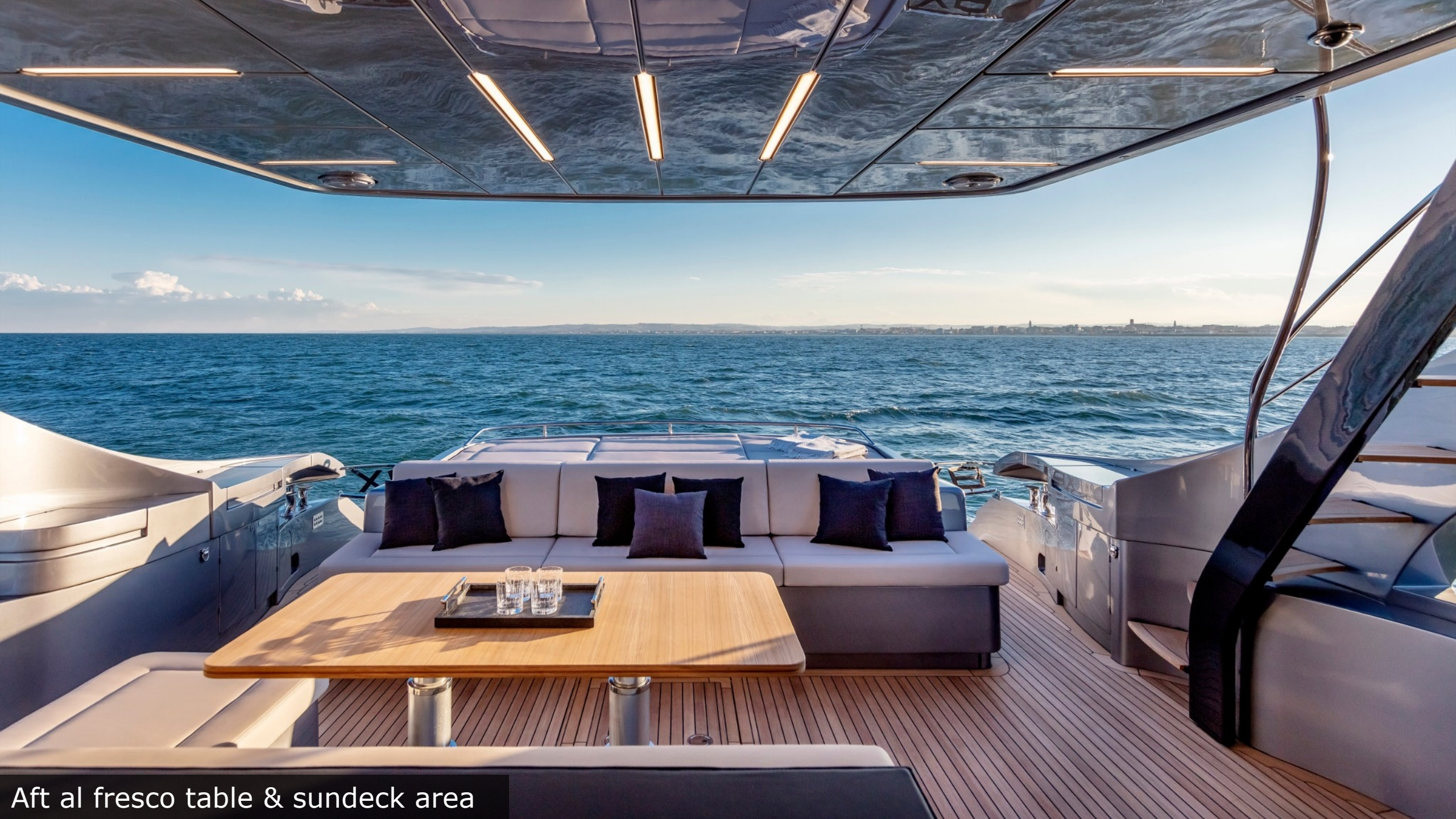
Aft al fresco table & sundeck area