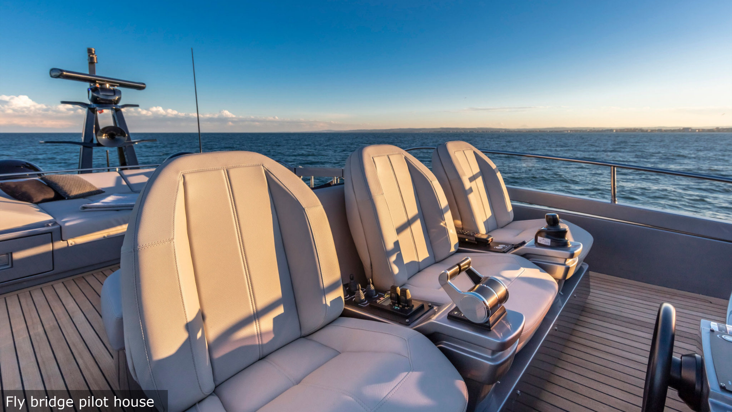
Fly bridge pilot house