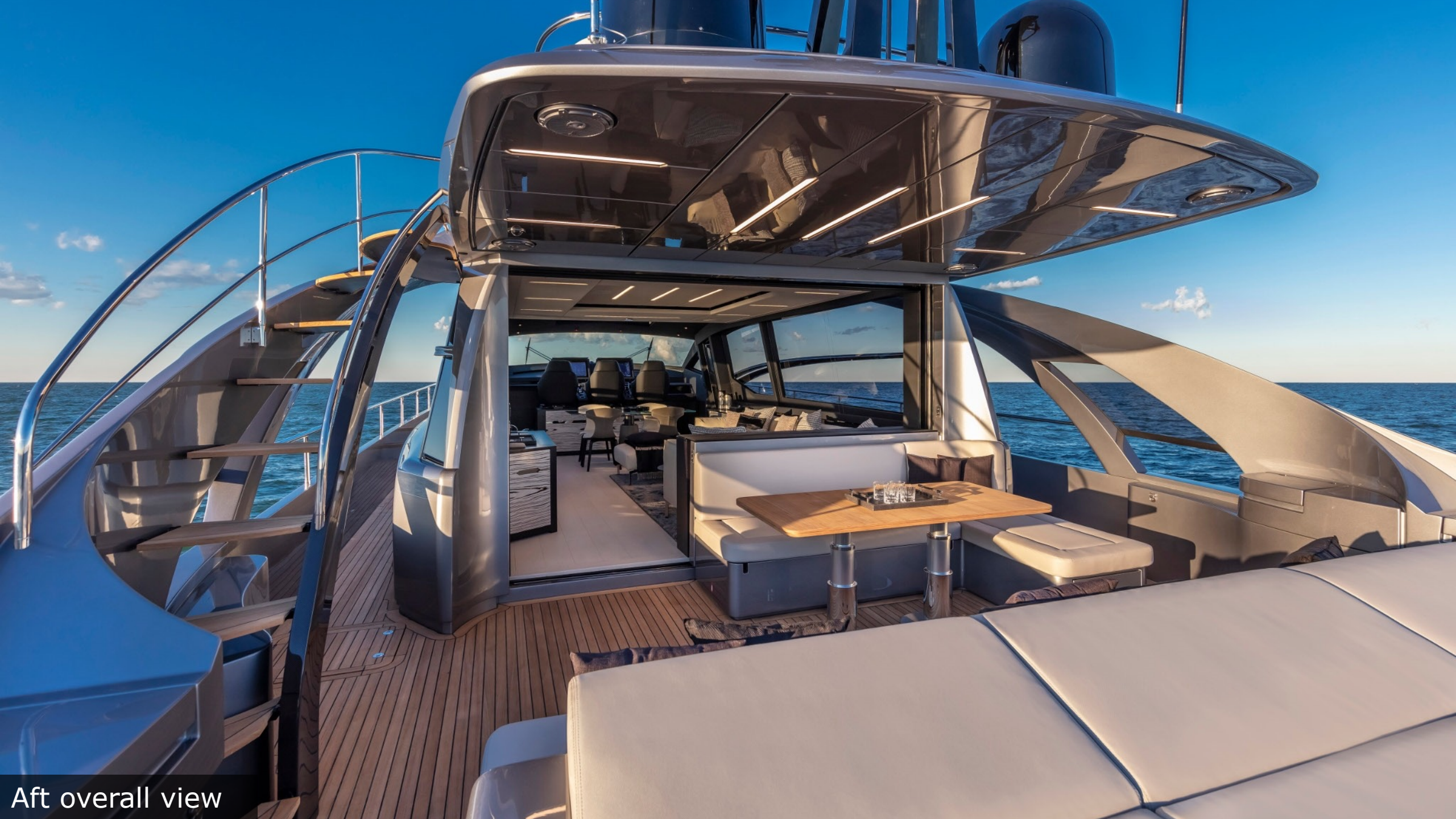
Aft overall view