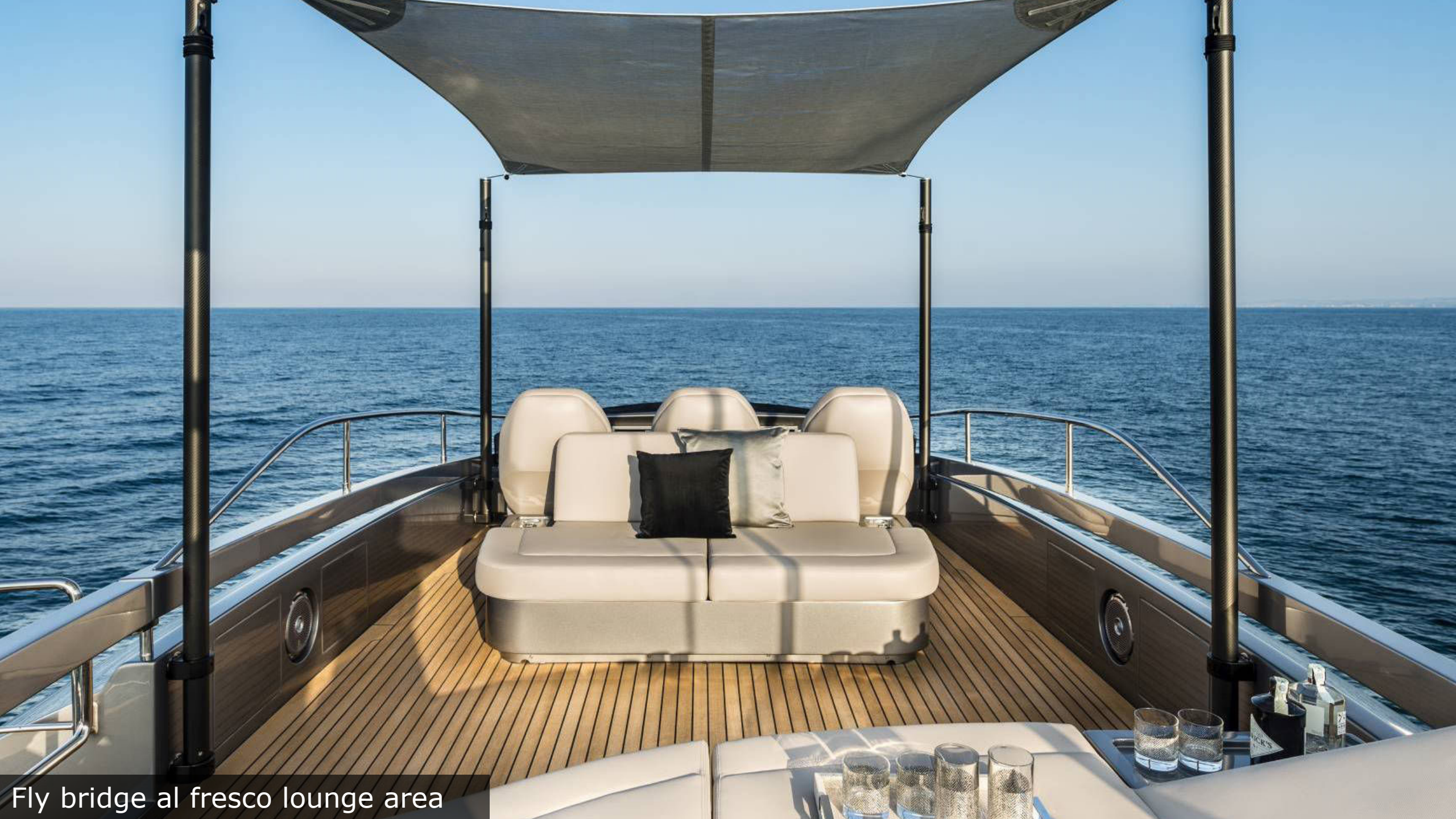
Fly bridge al fresco lounge area