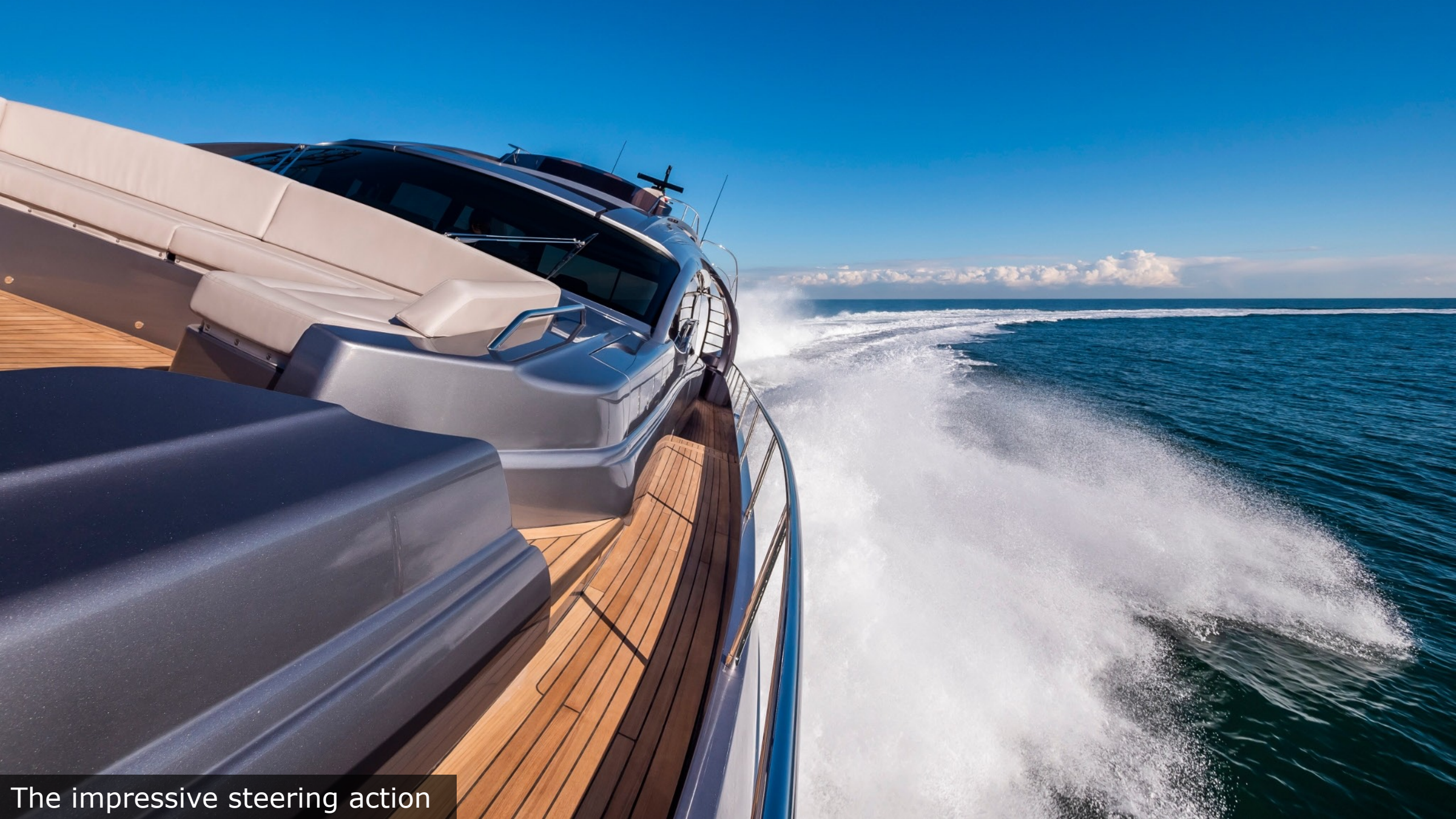
The impressive steering action