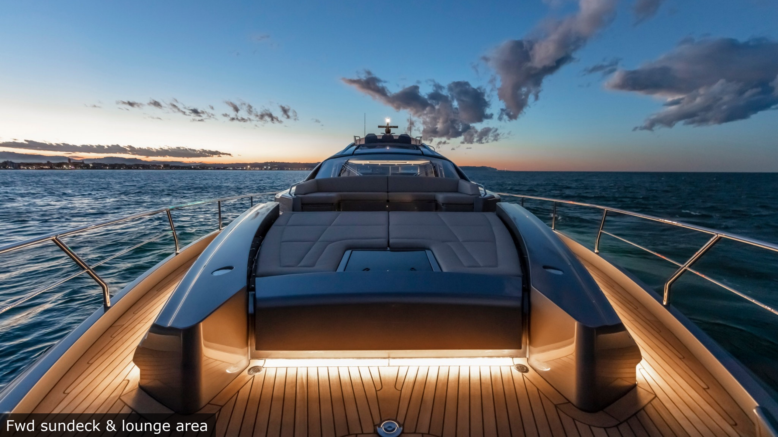
Fwd sundeck & lounge area